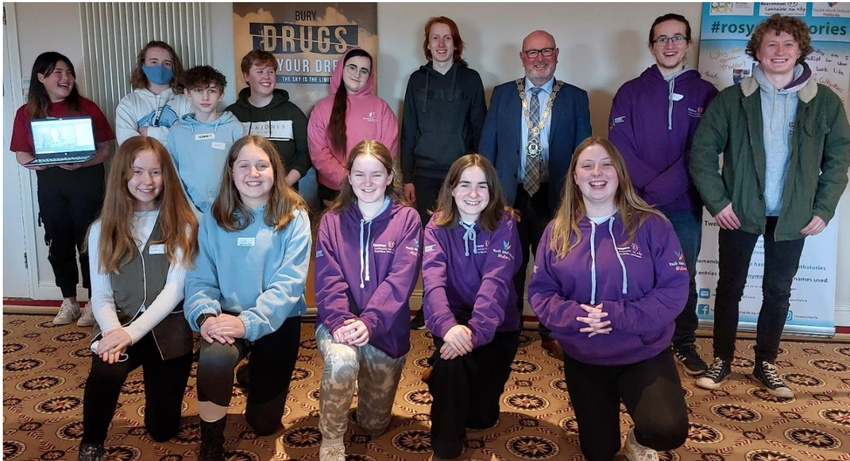
Meeting with Roscommon Co. Co. Cathaoirleach, Feb 2022

Mental Health Topic - In 2022 RCNN worked to implement their vision of supporting young people, schools and communities for a better future through the introduction of a non-clinical listening service, in every school in County Roscommon, with at least one appointment scheduled for every student during the school year, to provide support and early intervention for young people’s mental health. The youth committee developed a recommendation presentation for decision makers demonstrating the process of how the Comhairle came to be working on Mental Health, how the topic developed and their research to support the recommendation.